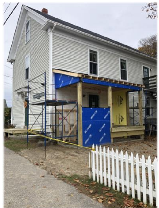
The New Universal Access Porch being built.