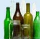
Glass Bottles (Food jars, beverage bottles) NO broken glass!