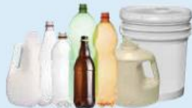
Rigid Plastic Containers (#1 - #7, 5-gallon pails)