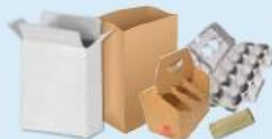
Boxboard (Dry-food boxes, paper bags, egg cartons, toilet paper and paper towel rolls)